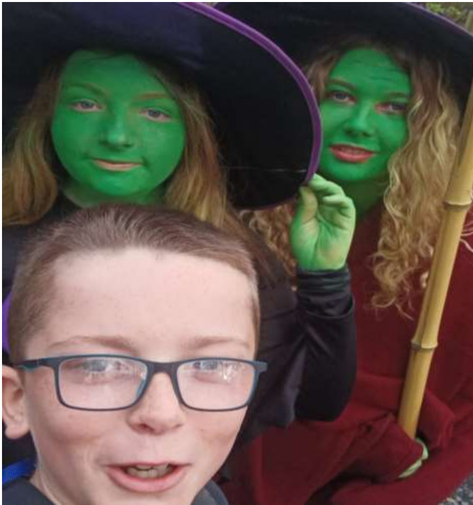
The Artane /Whitehall LEA Community Team supported Woodlawn Residents Association Halloween Event in the NDSL Centre off Coolock Lane, Dublin 17 (photos below)