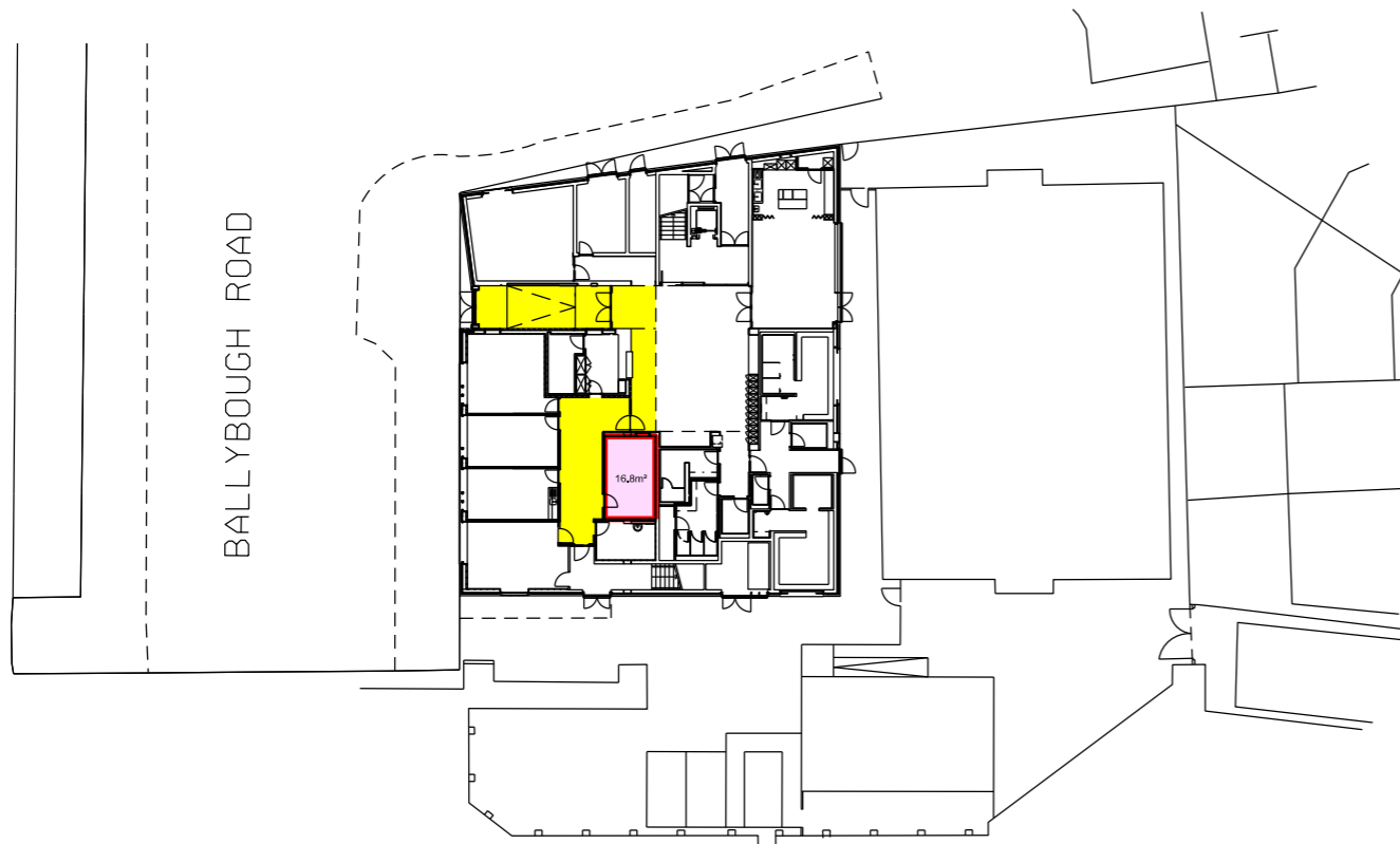
Ground Floor Plan Scale: 1:500