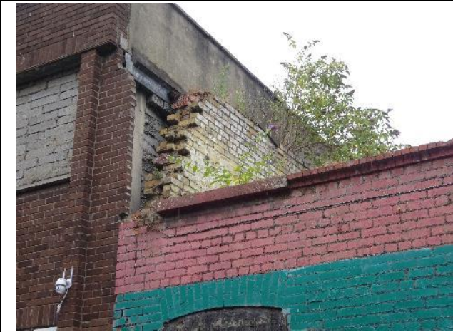
Fig. 5: 17/18 Henry Place, upper section of western party wall to 16 Henry Place.