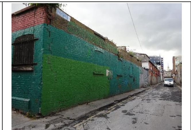
Fig. 4: 17/18 Henry Place, east elevation to Moore Lane.