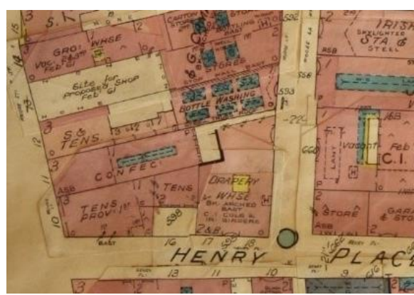
Fig. 10: Charles Goad, Insurance Plan of the City of Dublin, revised 1961