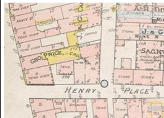
Fig. 9: Charles Goad, Insurance Plan of the City of Dublin, 1893