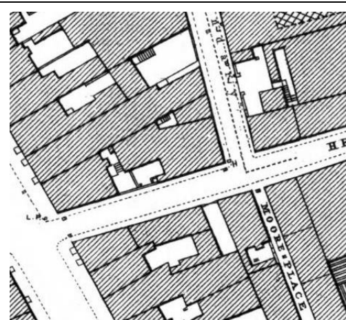
Fig. 8: Dublin OS sheet XVIII.47, 1891