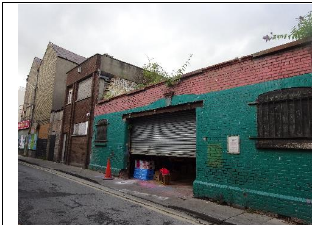
Fig. 3: 17/18 Henry Place, front (south) elevation.