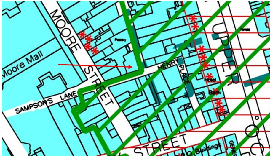
Fig. 1: Site Location and Land Use Zoning

The subject structure is located in an area zoned Z5, the objective of which is “To consolidate and facilitate the development of the central area, and to identify, reinforce, strengthen and protect its civic design character and dignity”.