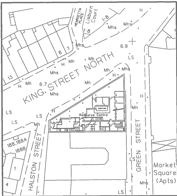
LOCATION MAP SCALE 1:1000