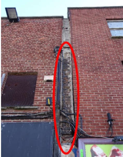
Fig. 5: Retained two-storey section of historic party wall (encircled red) between the modern new-builds at 12 (RHS) and 13 (LHS)