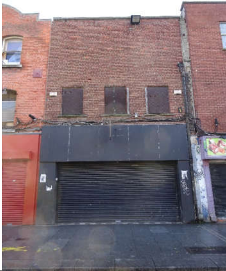
Fig. 3: The principal (west) elevation of No.13 Moore Street