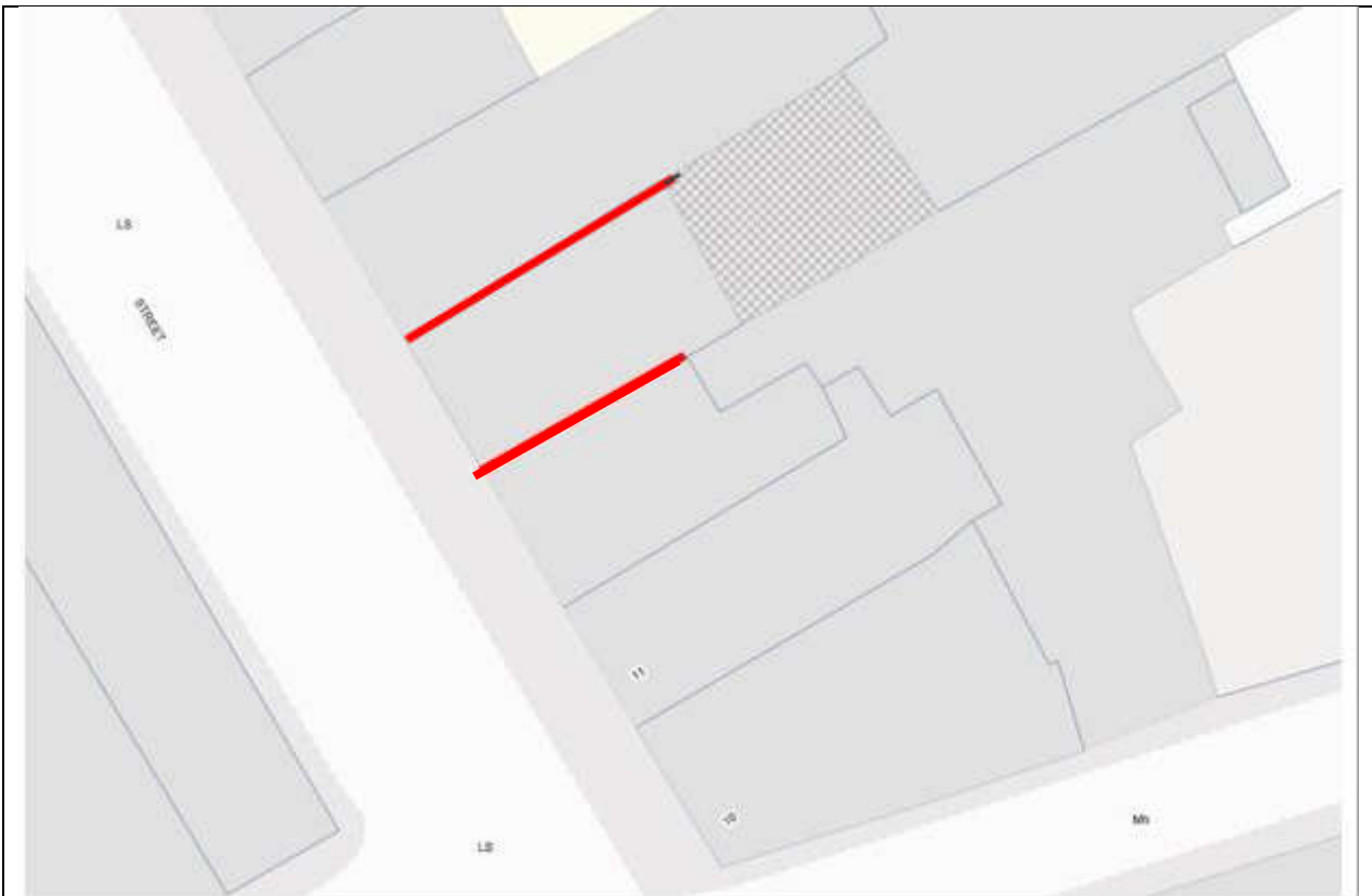
Figure 2: Section of surviving historic brick party wall between Nos. 13 and 12 Moore Street, and Nos 13 and 14 Moore Street, Dublin 1: extent of Protected Structure status and curtilage outlined in red. It is noted that No. 14 Moore Street is already on the Record of Protected Structures and forms part of the National Monument at 14-17 Moore Street, Dublin 1.

The extent of protected structure status & curtilage is shown on the map below in red.