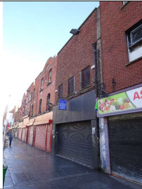
Fig. 4: 13 Moore Street in context with 14-17 Moore Street (National Monument) to LHS