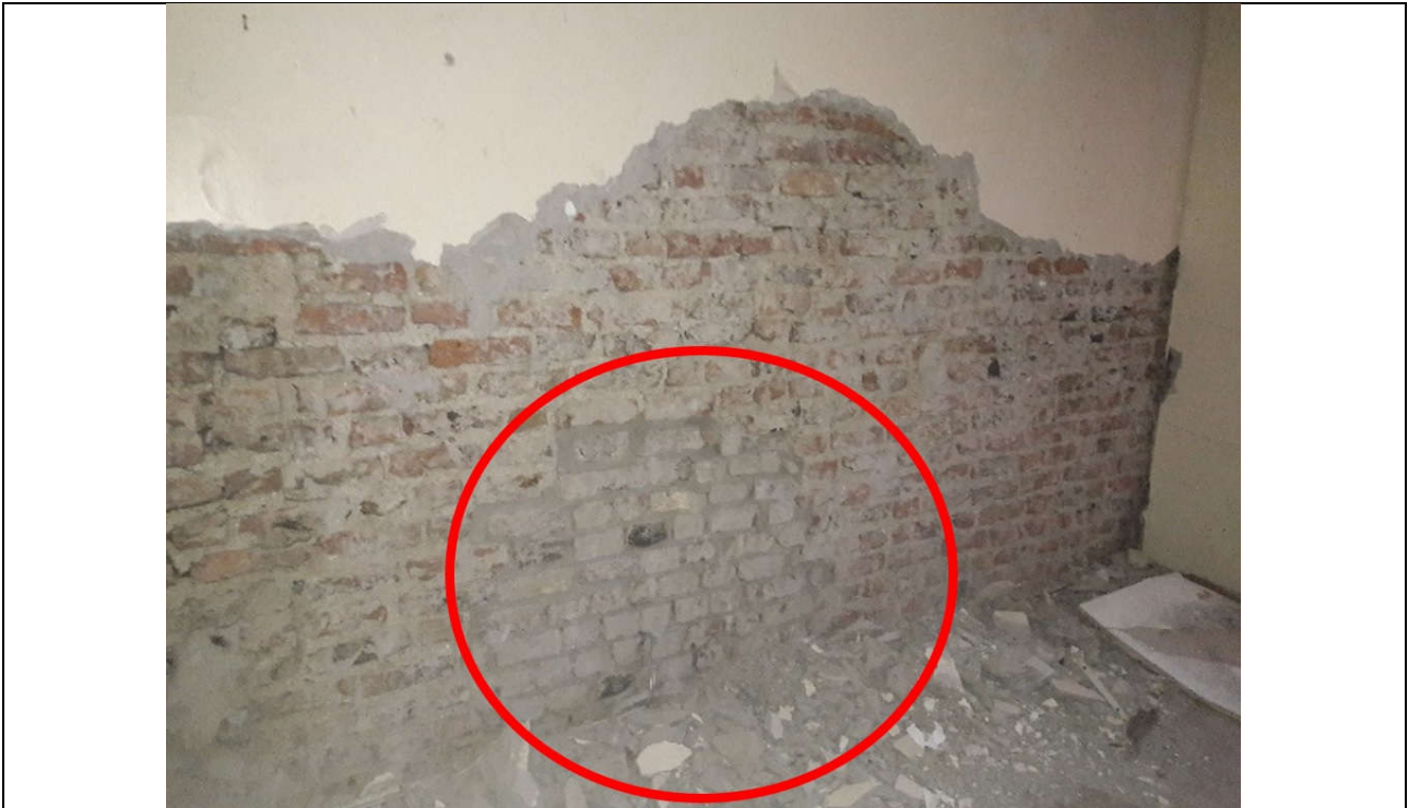
Fig. 7: Historic brick party wall at first floor level in 13 Moore Street. The infilled 'creep hole' is shown encircled in red.