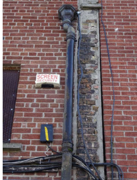
Fig. 6: Detail of the retained historic brick party wall between 12 and 13 Moore Street