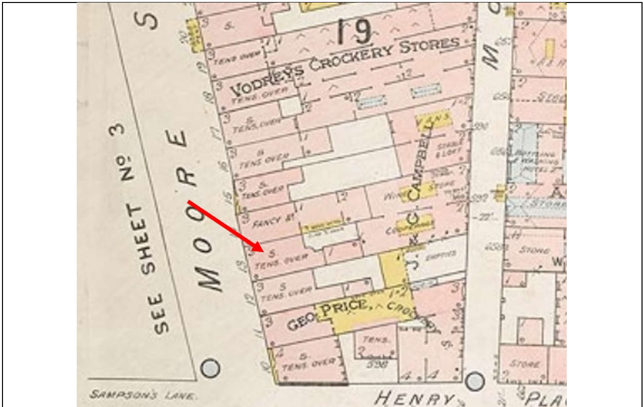
Fig. 9: 1893 Goads Insurance Plan of the City of Dublin, with 13 Moore Street arrowed in red.