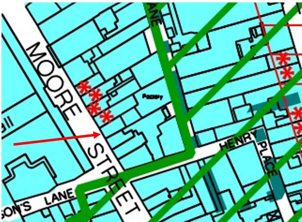
Figure 1: Site Location and Land Use Zoning

The subject structure is located in an area zoned Z5, the objective of which is “To consolidate and facilitate the development of the central area, and to identify, reinforce, strengthen and protect its civic design character and dignity”.