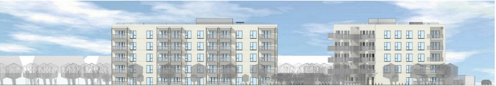
Elevation onto GAA pitch