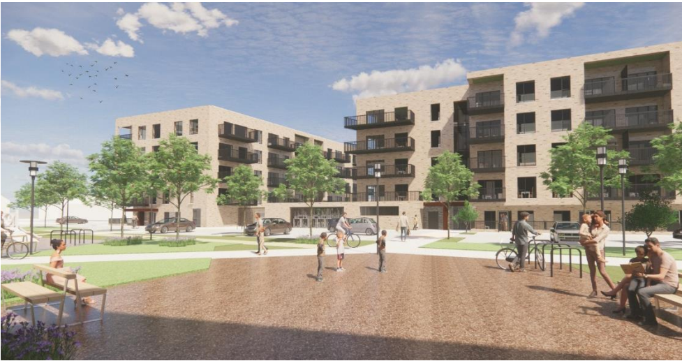
View onto POS