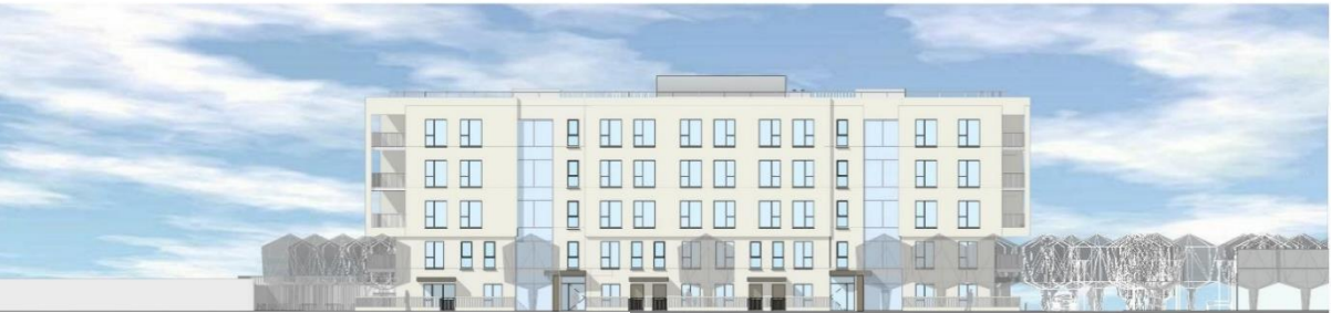
Elevation onto Collins Ave.