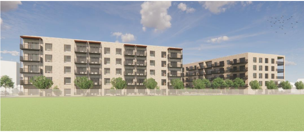
View onto GAA pitch