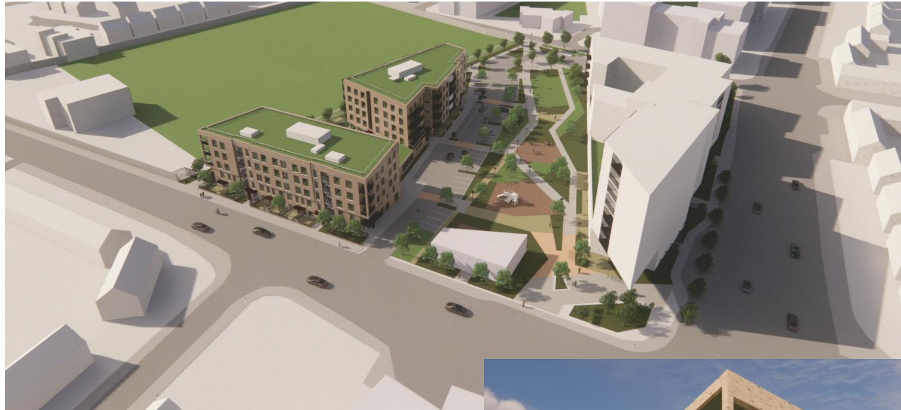
North West Axo View