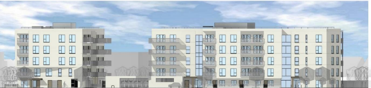
Elevation onto POS