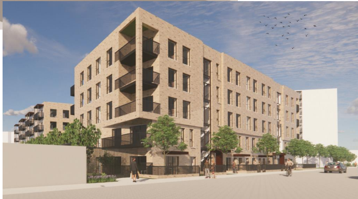
View along Collins Ave.