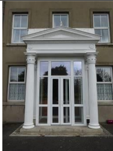
Fig.10: Painted stone portico (Portland limestone) with lotus leaf capitals, now with glazed porch inserted.