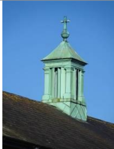
Fig. 6: Copper-clad lantern surmounted by cross finial to centre ridge of chapel.