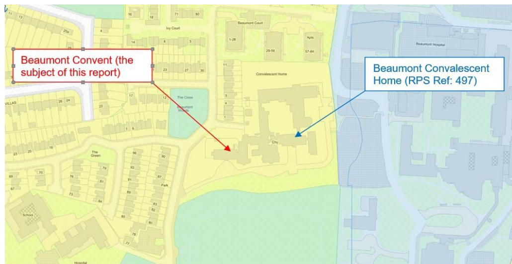
Fig.1: Site location and zoning map for Beaumont Convent, The Park, Beaumont Woods, Dublin 9 (arrowed red). The subject site is zoned Z1 in the Dublin City Development Plan 2016-2022, with an objective “to provide for sustainable residential neighbourhoods”. The former Beaumont Convalescent Home is arrowed blue, this is on the current Record of Protected Structures under RPS ref: 497. Note: The current GIS and Ordnance Survey mapping does not reflect the removal of link corridors and erection of a new boundary separating Beaumont Convent from the former Beaumont Convalescent Home as granted under planning permission per Ref: 3248/11.

The adjacent former Beaumont Convalescent Home is on the current Record of Protected Structures (Volume 4 of the Dublin City Development Plan 2016-2022). The RPS reference number for the property is ‘497’ and the description reads ‘ Beaumont Convalescent Home: Georgian house, including granite entrance gate piers, gates and curved entrance wall ’.