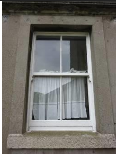
Fig.9: Two-over-two sliding sash window having ogee horns to link corridor to north and west of chapel representing surviving historic timber sashes.