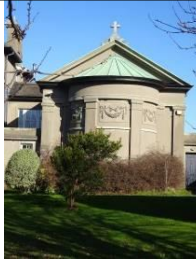
Fig.4: Semi-circular apse to chapel with copper-clad roof and giant order of Doric pilasters.