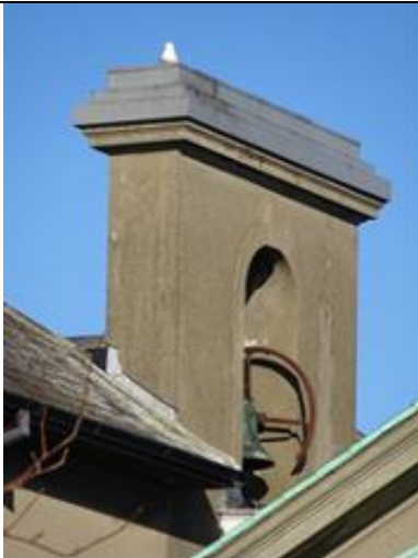
Fig.7: East chimney stack incorporating bellcote, housing a bronze bell with bell wheel.