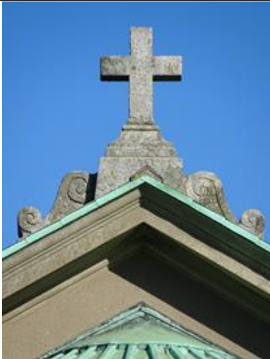
Fig. 5: Granite cross finial to gable apex of chapel.