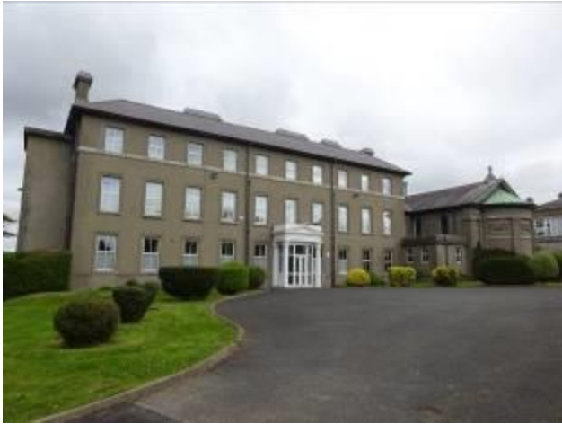
Fig.3: Principal elevation of convent with chapel to right of image.