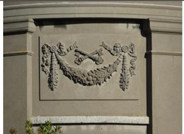
Fig.8: Decorative render panels incorporating swaged embellishments and the keys of Saint Peter.