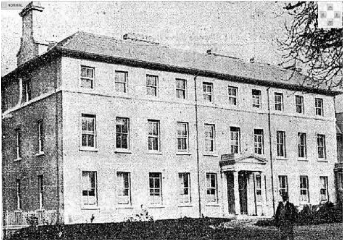
Fig.11: Beaumont Convent depicted shortly after completion as published in the Irish Times on the 15 th November 1928 (Image courtesy of the Irish Times Archive). Available at: https://www.irishtimes.com/newspaper/archive/1928/1115/Pg003.html (Last accessed: 26th March 2021).