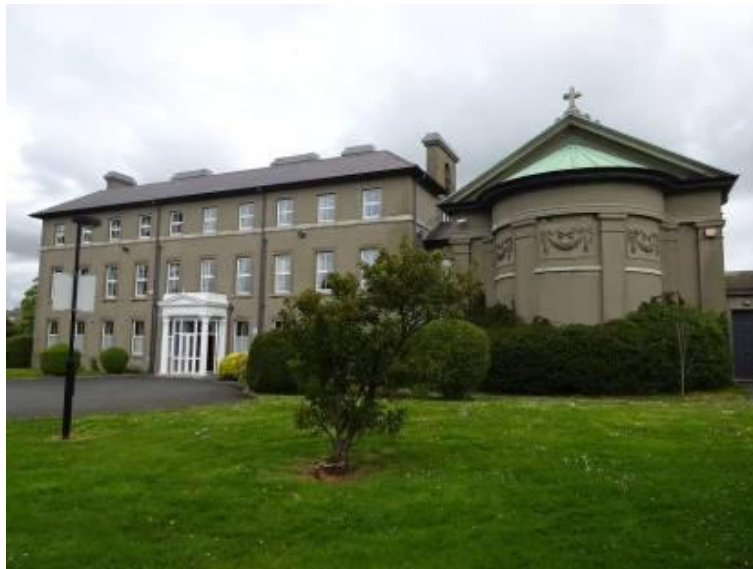
PHOTO OF STRUCTURE