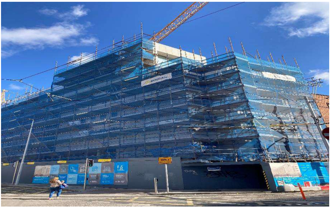
Works on the corner building stone cladding near complete