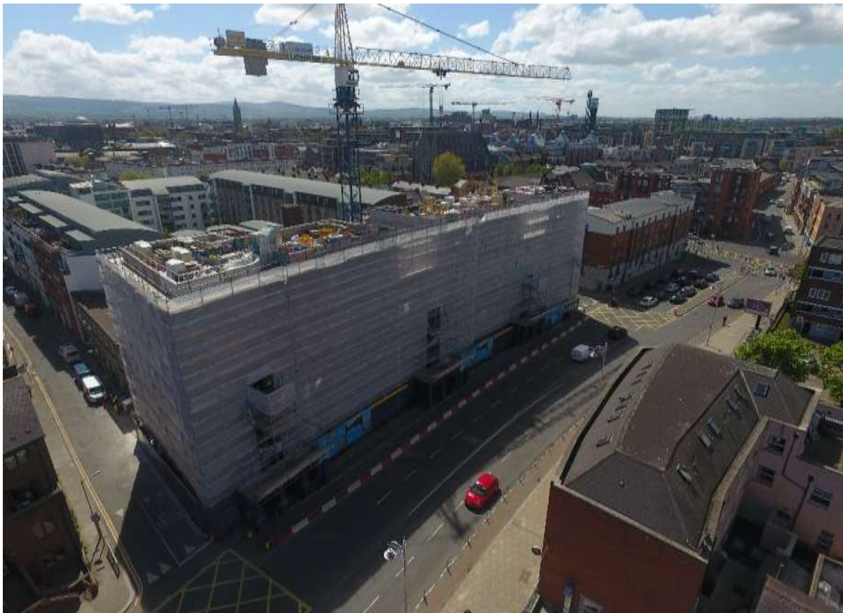
View of Site Works Progressing

Weathering works to all roof areas have now been completed and green roofing and plantings are planned to be installed in late July.