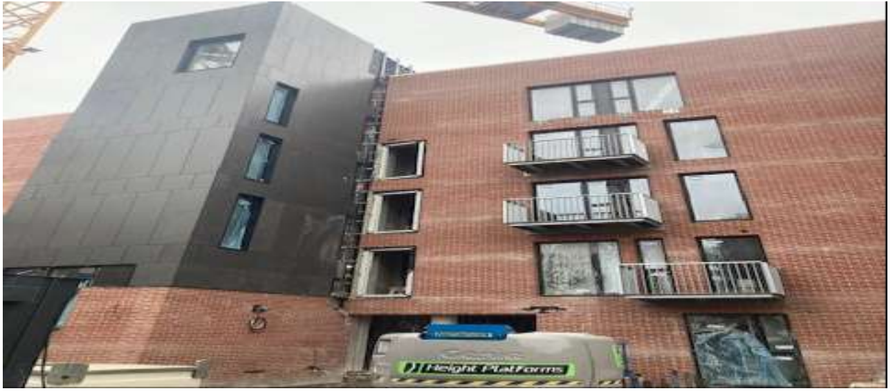
Works on the façade nearing completion & scaffolding being removed