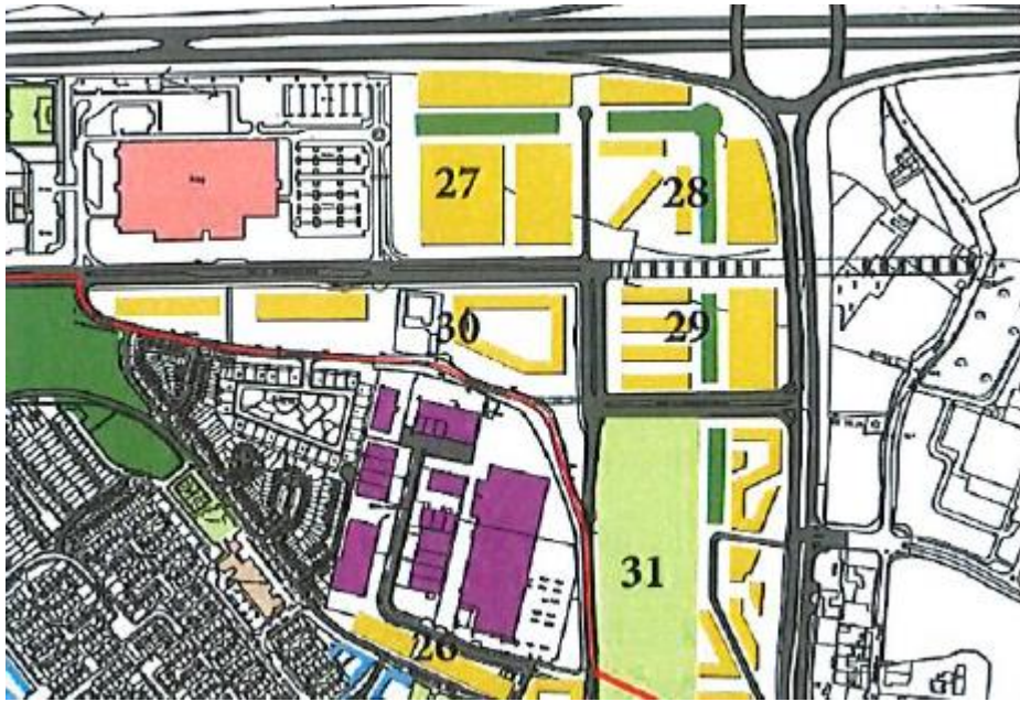
Figure 2: Site is located within sites 27 (part of) & 28 of the Ballymun Local Area Plan 2017.