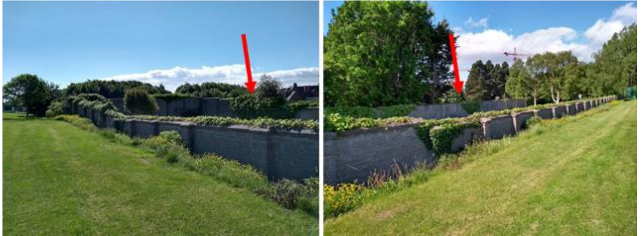
Wall has a modern render of pebble dash. No historic fabric was visible.

Wall 4: Views of surviving short section of wall to south of St. Vincent's Club. The north side of the wall are pebble dashed. According to the 2009 ACA report, this section of wall is of similar composition to the other upstanding sections. This wall forms the boundary between a graveyard and the Marino Institute of Education. This wall was not accessible.