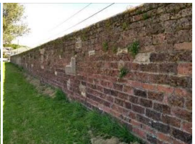
View of south side of wall