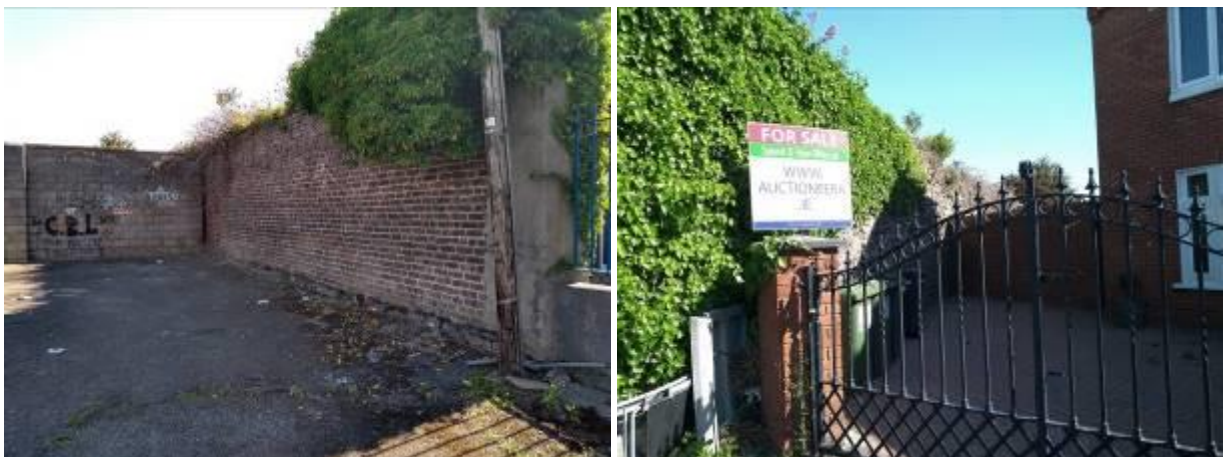
Former walled garden wall. Brick on western side and calp limestone on eastern side.