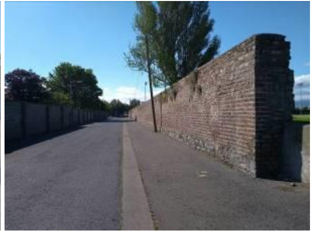
View of north side of wall running alongside entrance lane to club