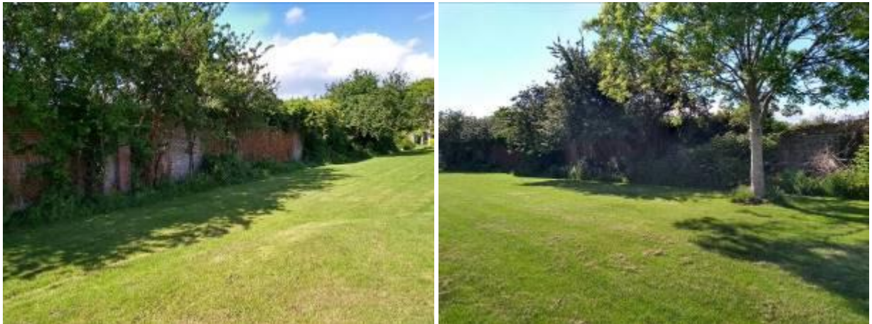
Views of brick wall to south end of GAA club. The wall is heavily overgrown in places.