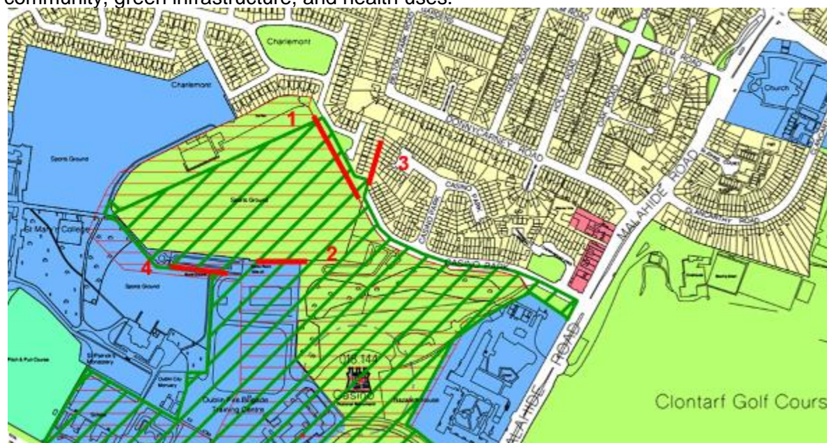
Fig. 1: Site location and zoning map for historic boundary walls. The four sections of surviving historic boundary wall are highlighted in solid red line on the zoning map above.

Blue: Zoning Objective - Z15: To provide for institutional, educational, recreational, community, green infrastructure, and health uses.