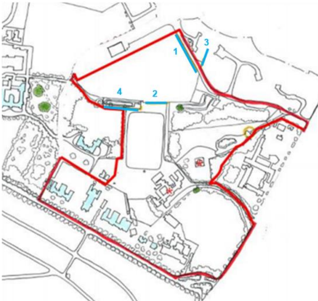
Fig.2: Map showing boundary of the Casino, Marino ACA in red. The location of the surviving four sections of former demesne wall are shown in blue.