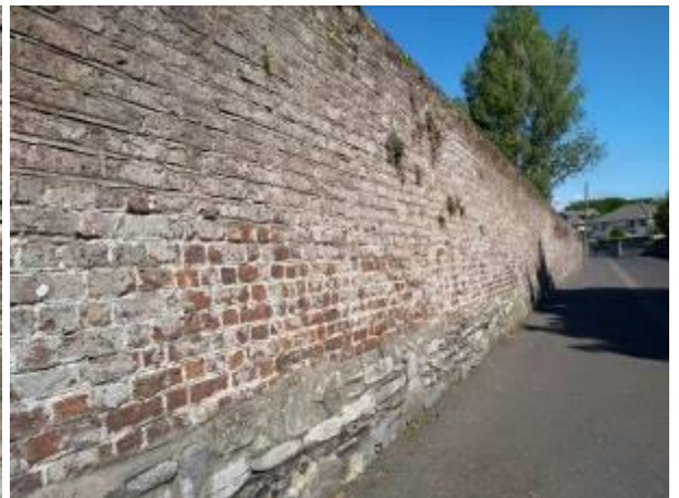
Note surviving penny struck lime mortar joint.