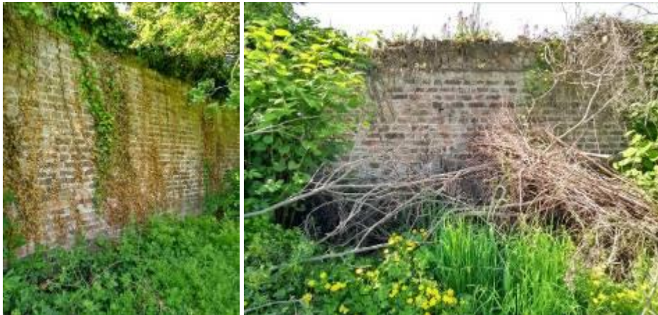
Weathered brick wall with original mortar joints visible.