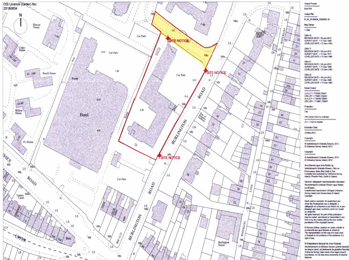
EXISTING SITE LOCATION MAP