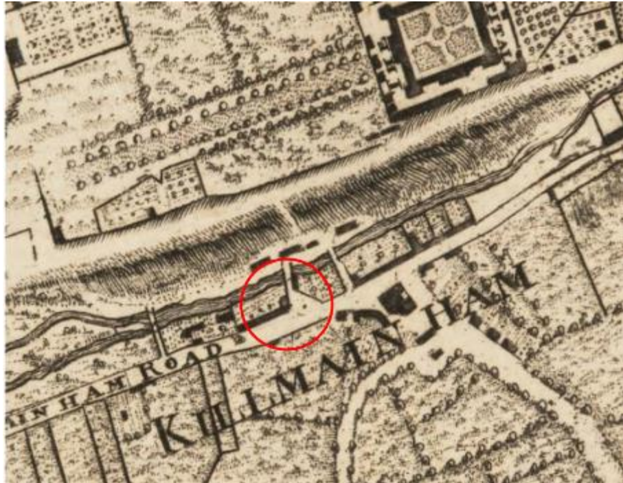
Fig. 9: Extract from Rocque's Map of the city of Dublin and environs, 1757, location of subject structure outlined in red.