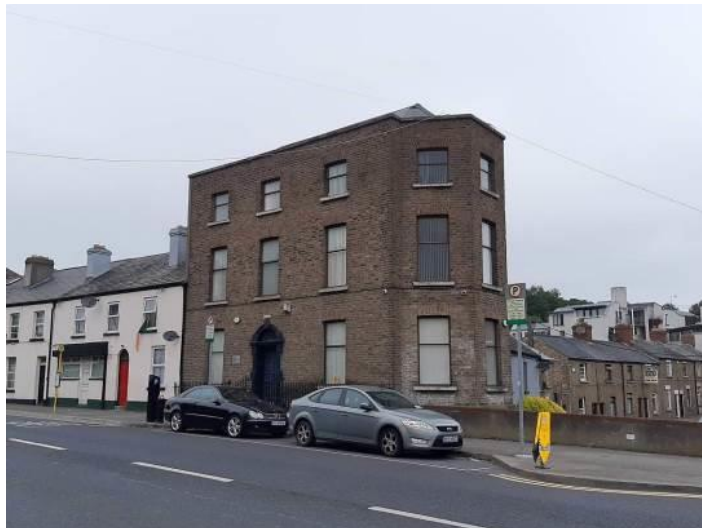
Fig. 4: Site context from southeast.