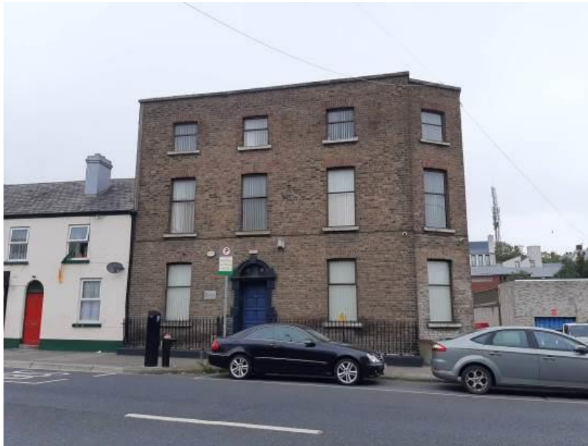
PHOTO OF STRUCTURE