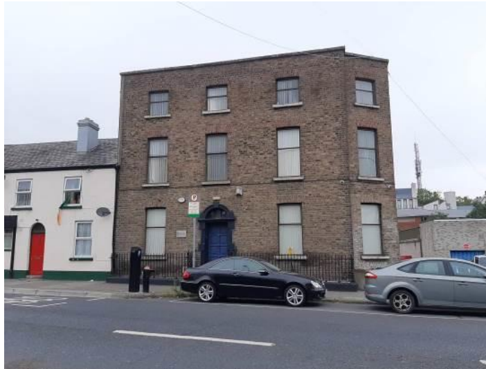
Fig. 3: Front (south) elevation.