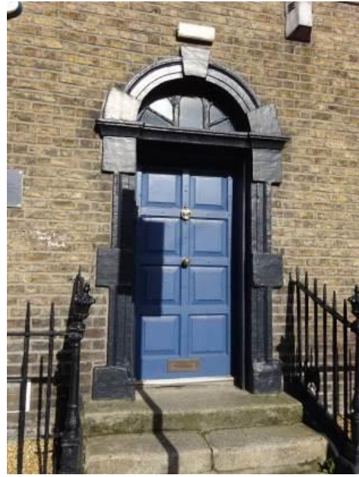
Fig. 7: Block-and-start doorcase to front elevation.