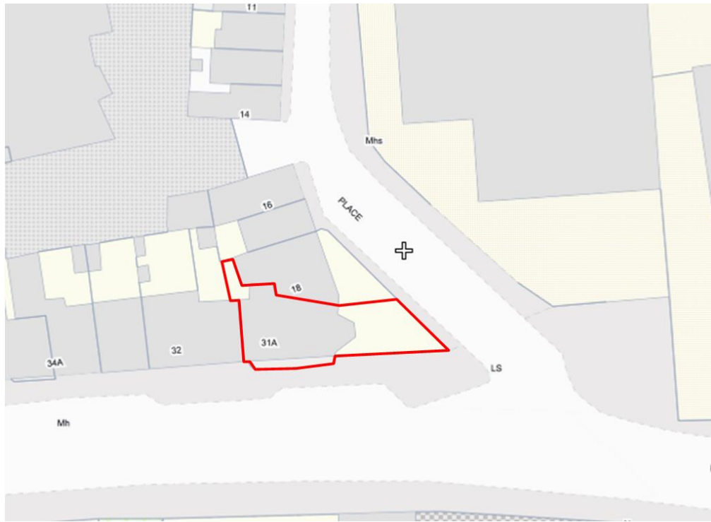
Fig. 2: No. 31 Old Kilmainham, Dublin 8, extent of Protected Structure status and curtilage outlined in red.

The proposed protected structures and their curtilage are outlined below in red. The curtilage extends to the boundaries as shown on the map below.