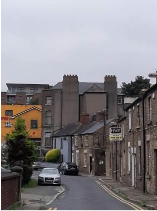
Fig. 6: Site context from north showing two-storey early twentieth houses to Kearns Place