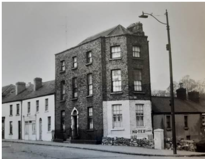
Fig. 5: Archive photograph of No. 31 Old Kilmainham (source Irish Architectural Archive, ref. 2001/051-PH 202).