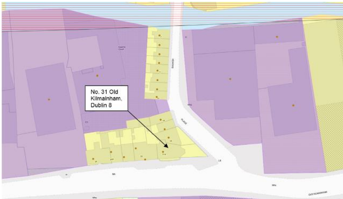
Fig. 1: Site location and zoning map of No. 31 Old Kilmainham, Dublin 8.

No. 31 Old Kilmainham, Dublin 8 is located on the north side of Old Kilmainham at its junction with Kearns Place, west of Dublin city centre. It is located to the south of the River Camac and to the southwest of the Royal Hospital Kilmainham.