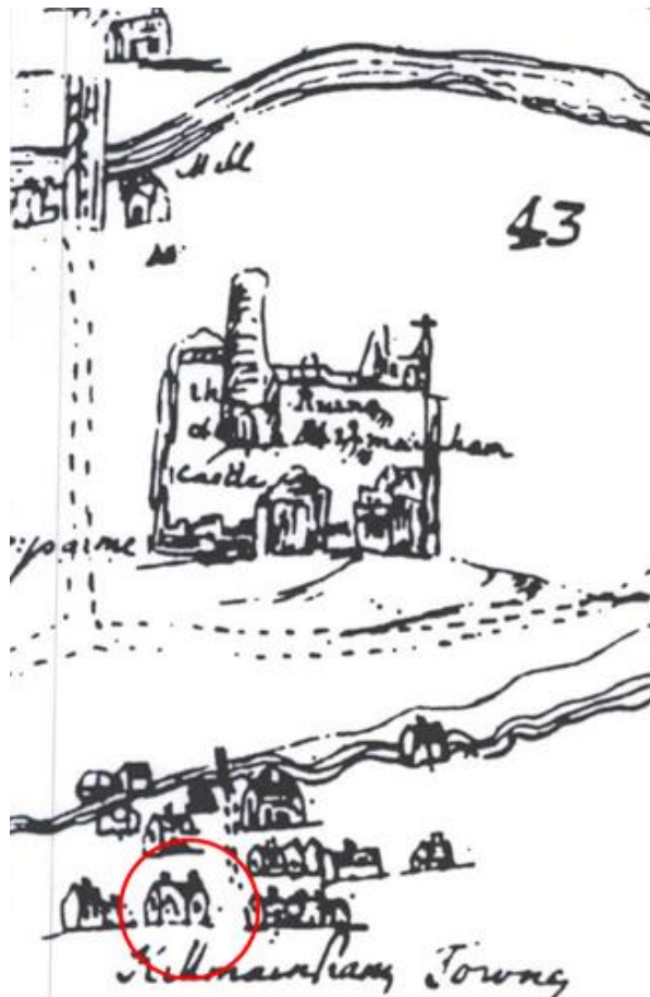
Fig. 8: Kilmainham Down Survey Map c.1655-56 by Robert Girdler, suggested location of subject structure outlined in red.