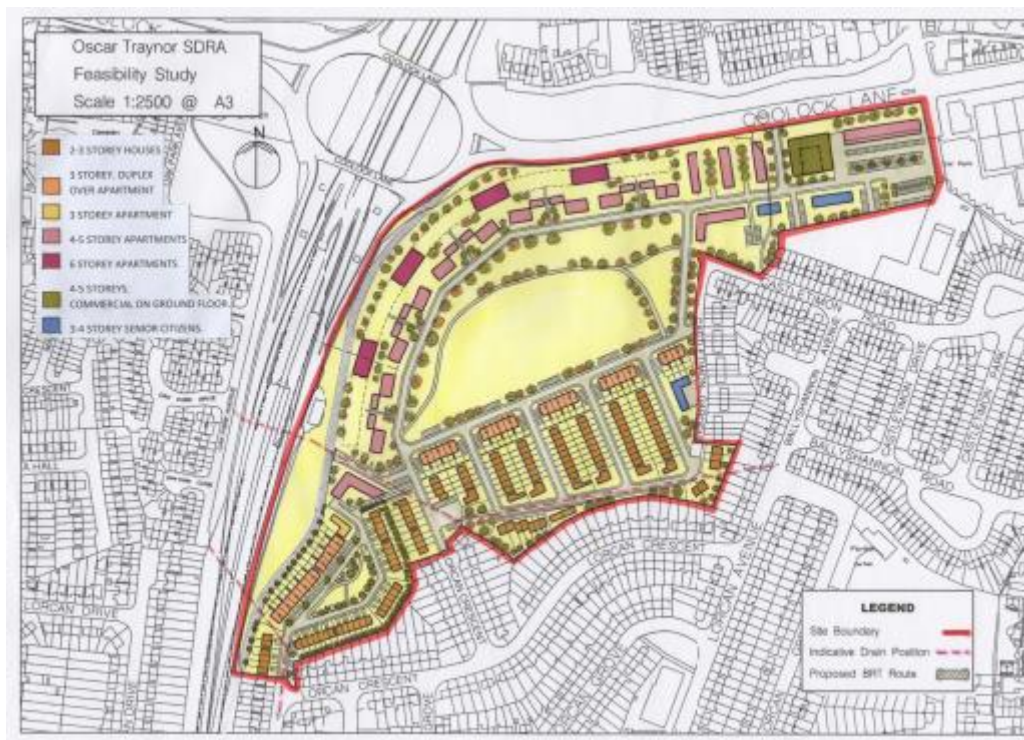
Figure 6: Layout and Site Constraints Map from Housing Land Initiative Report