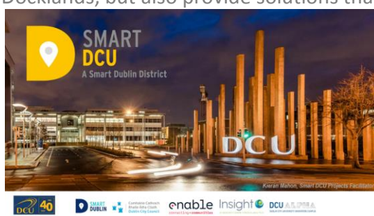
Smart DCU (Dublin City Council)

Smart Docklands successfully facilitates and enables the testing and trialling of smart city solutions by identifying real local challenges and working with diverse stakeholders to come up with lasting solutions in areas such as disruptive technology, environmental monitoring, waste management, and smart mobility. Our mantra is do not deploy “tech for tech’s sake”. Through our community engagement programme we work closely with a diverse range of stakeholder groups including physical infrastructure companies, utility providers, property developers, building owners and local residents groups to identify challenges which can be addressed through new smart city technology and applications. Over 250 participants have provided us with hundreds of challenges and concerns which are actively being used to inform the direction of new pilot projects across the Docklands Smart City test bed – everything from safety issues, to better management of waste, flooding alerts, better connectivity, congestion and water safety issues. Through collaborative effort, Smart Docklands not only has the ability to transform Dublin City and improve the lives of those who live and work in the Docklands, but also provide solutions that can be scaled globally.