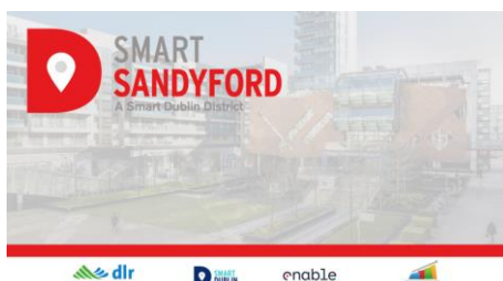
Smart Sandyford (Dun Laoghaire-Rathdown County Council)

Areas and projects of interest include buildings/campus management, energy & sustainability, future transport, connected health/well-being, community engagement, IoT & data analytics test bedding, accelerator and incubator programmes, amongst other activities. As part of the New Horizon Europe Programme, under the Carbon Neutral and Smart Cities Mission, DCU will be making an application for funding to become one of Europe's first '100 carbon neutral cities by 2030'