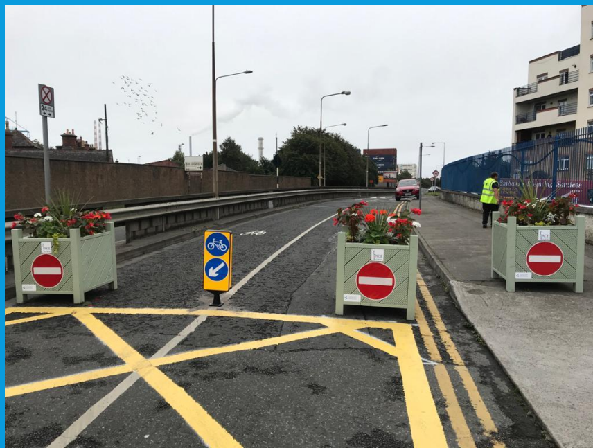
Filtered Permeability measures east of Poolbeg Quay apartments