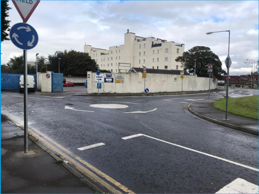
Mini-Roundabout turning point at Pump Station