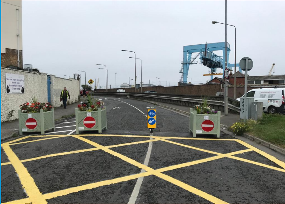
Filtered Permeability measures north of Ringsend Recycle Centre