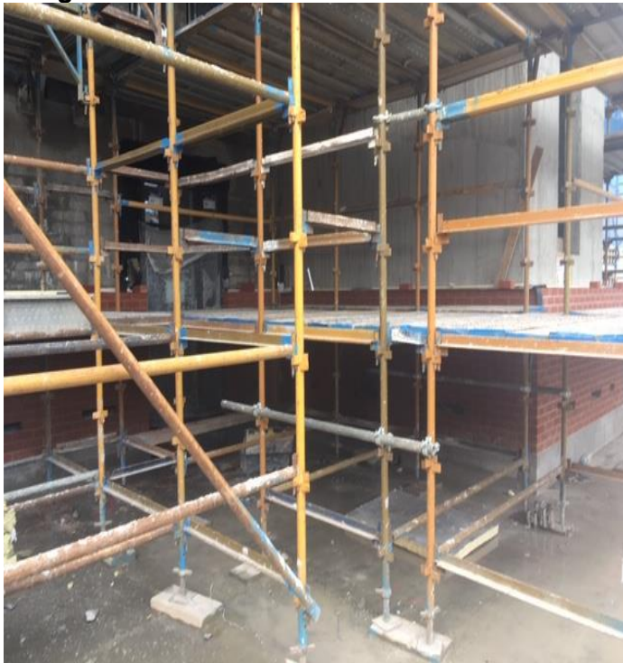
Image of Window Installation and Brickwork commencing.

Ongoing monthly meeting has recommenced with Duggan Brothers, Residents & DCC Officials.