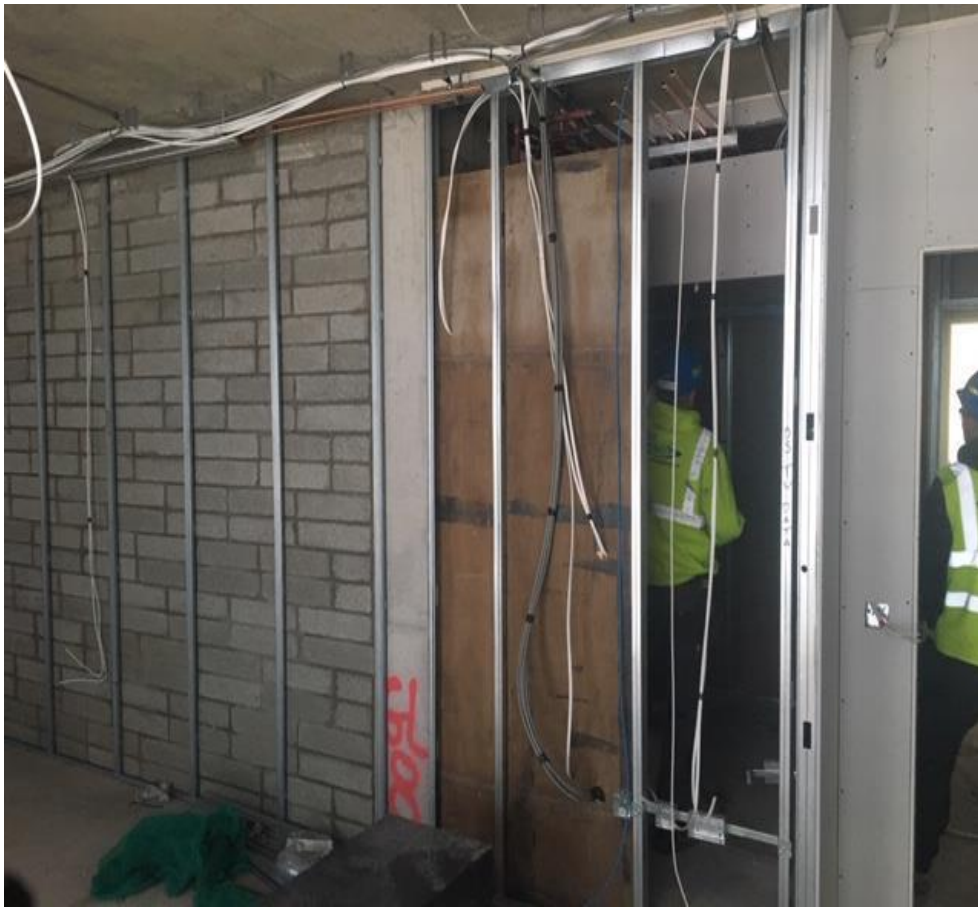
Structural Frame Works Dominick Street Facade