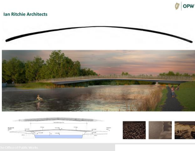
The Office of Public Works