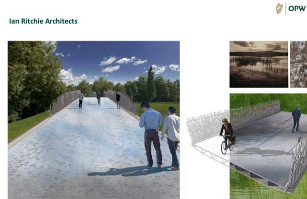
The Office of Public Works