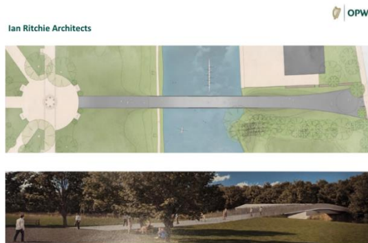
The Office of Public Works