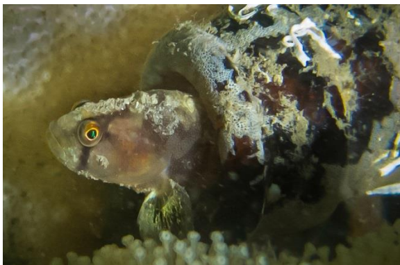
“BYOB Dalkey sound”