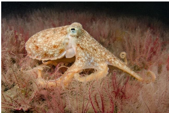
“Octopus at Night” by Nigel Motyer