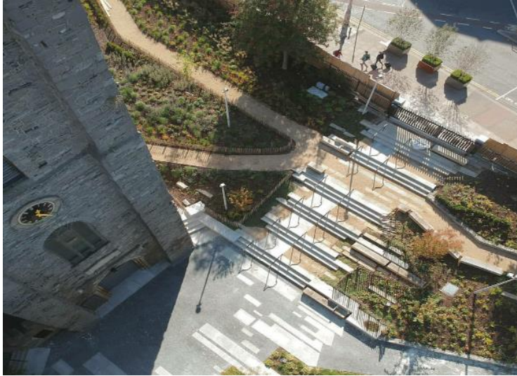
Aerial view of new entrance to St. Audeon's Park from High Street.