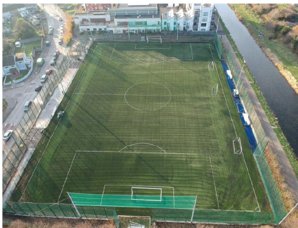
An Aerial shot of the new All-Weather Pitch at Bluebell

A new synthetic all-weather pitch was constructed on an open space adjacent to the Bluebell Community Centre. The contractors remain on site pending completion of a snag list and it is expected the pitch will be officially opened by the Lord Mayor in January 2019.