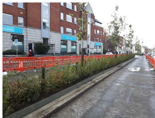
High Street central median images (before and after)