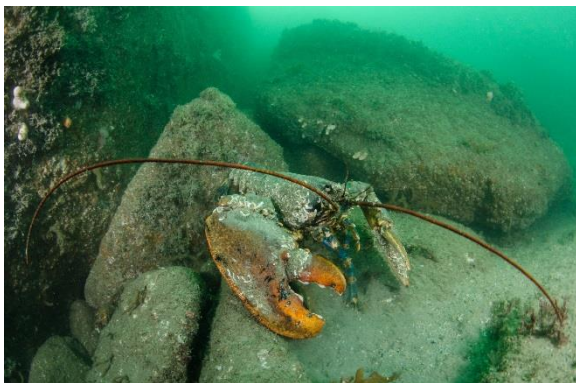
“Oldest Lobster in the Bay” by Nigel Motyer,

Images below show the winning entrants in the various categories: