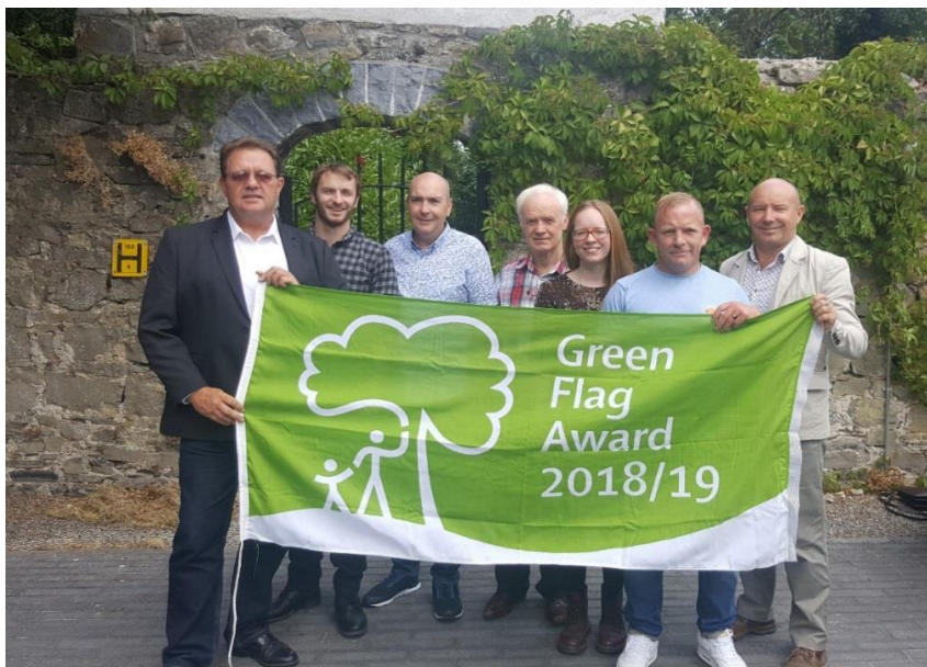
Parks staff who accepted the awards at this year’s Green Flag Awards.

Dublin City Council Parks and Landscape Services were successful in retaining the ‘Green Flag’ status of all 5 Green Flag parks: St. Anne’s Park, Poppintree Park, Markievicz Park, Bushy Park and The Basin, Blessington Street. This is an international benchmarking standard for Parks and Open Green Spaces judged for their horticultural standards, cleanliness, sustainability and community involvement.