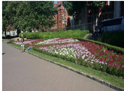
St. Patrick's Park