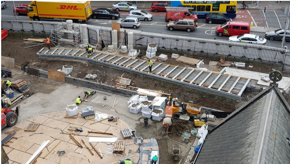
Image from roof of Christchurch Cathedral of works in progress

The Parks Service managed the re-development of the grounds of Christchurch Cathedral which was part funded by a grant from Failte Ireland.