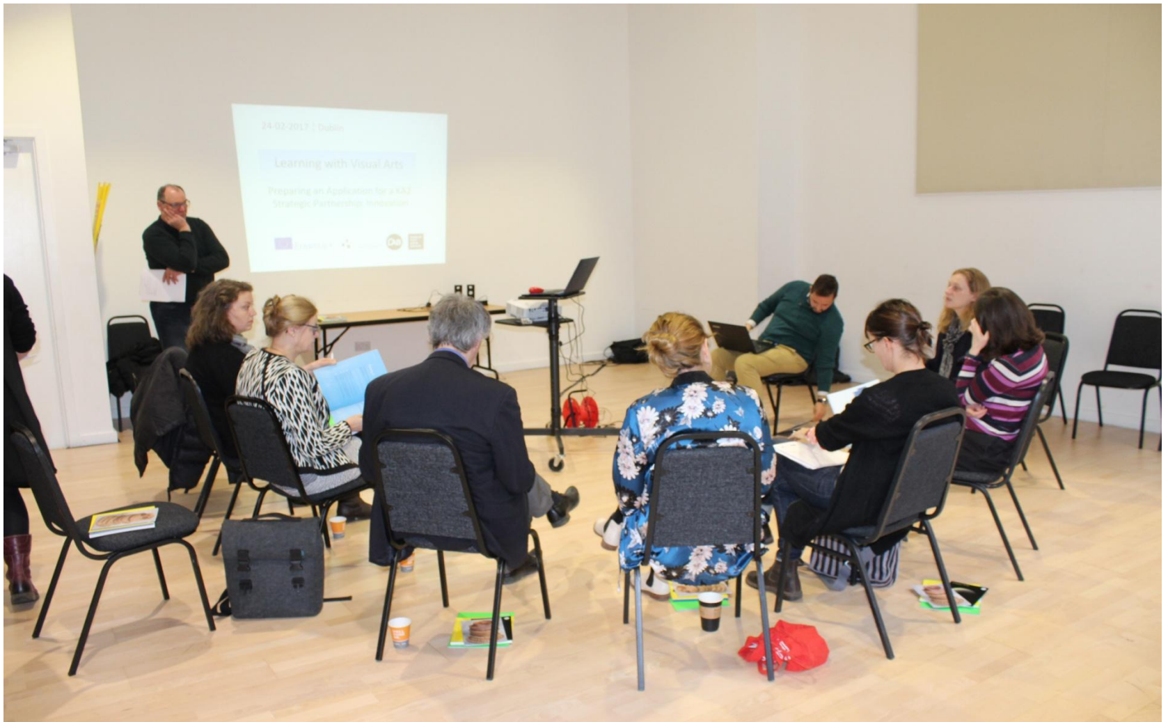
Potential EU Project Partnership