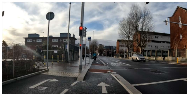
Fig 1 – Clontarf to City Centre Inbound Cycle-track at Newcomen bridge – as-built layout

As it may not be initially obvious that it is necessary to utilise these ramps in order to turn right from North Strand Road a right-turn arrow on the ramps has been provided to communicate this message. Space is limited on the ramps and the markings have regulatory sizes and layouts. Cyclists can queue on the ramps if required out of the way of the straight-through cyclists and can progress with care to the shared space and turn left to continue their journey or turn right to the toucan crossing to cross North Strand Road.