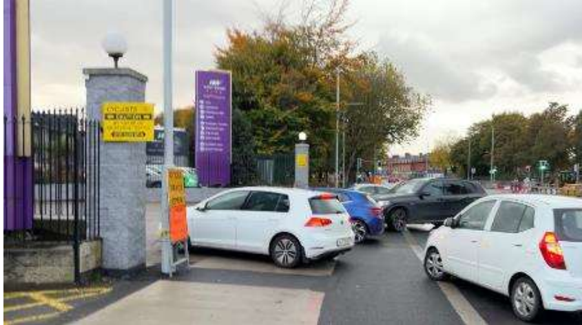
Figure 1 – Queuing at Westwood Gym Entrance with no restriction on turning movements (December 2023)