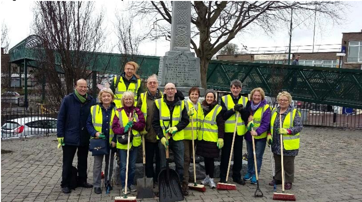
Some participants in the Finglas Tidy Towns Team Dublin Cleanup Event about to start a sweep around the newly cleaned McKee Memorial in Finglas Village

A special well done to all the groups and individuals who helped clean up their neighbourhoods for the holiday weekend.