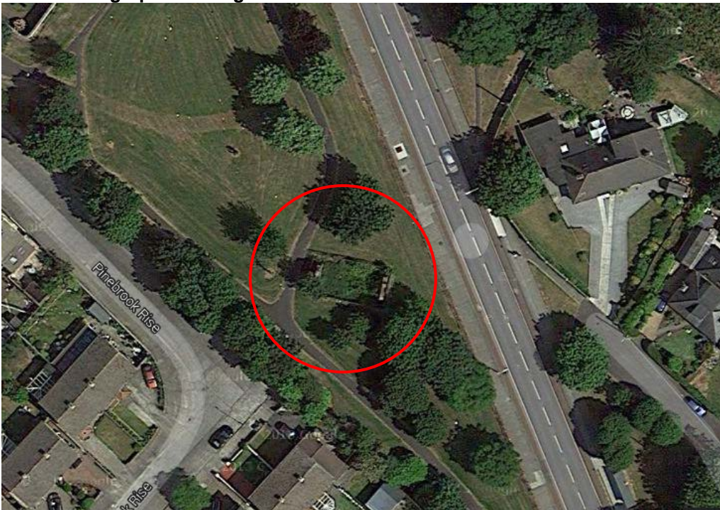
Aerial Photograph showing location of church circled in red: