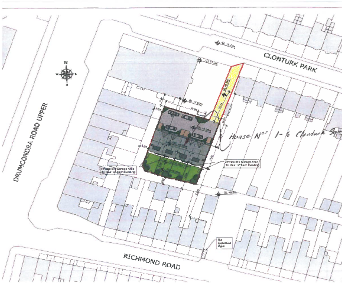
PROPOSED SITE LAYOUT PLAN